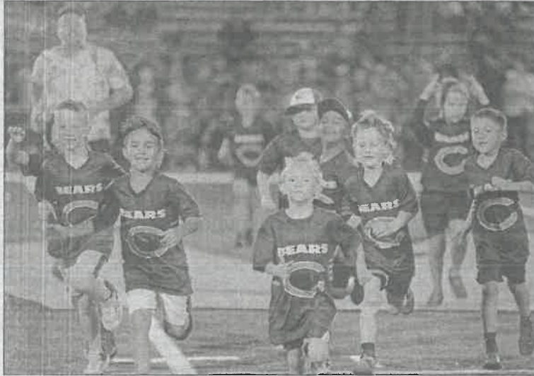
Villa Park Review

with Willowbrook's varsity football team holding a scrimmage against the Fenwick High School Friars. Friday's event also included introductions of the Villa Park Warriors Youth Football and Cheer program's teams. Willowbrook's stadium will be packed for the 2024 season-opening football contest between the Warriors and nearby Glenbard East, which will take place this Friday, Aug. 30. The Warriors and Rams haven't met on the football field since 2015.