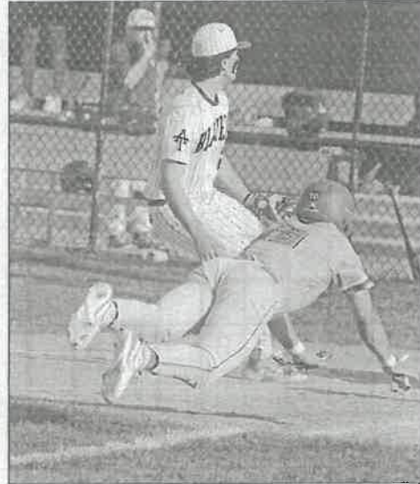
Rock Valley Public