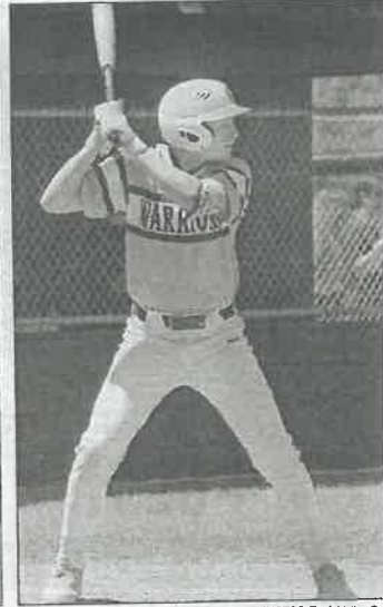
Rock Valley Pub