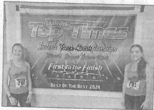
SUBMITTED PHOTOS Rock Valley Publishing