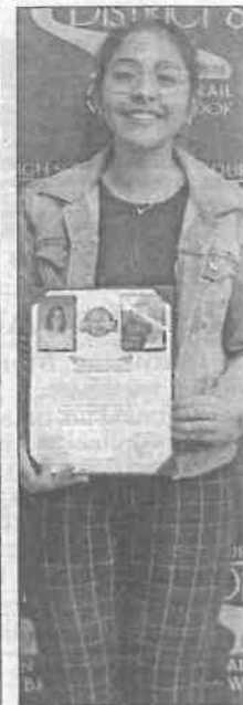
SUBMITTED PHOTO Rock Valley Pub