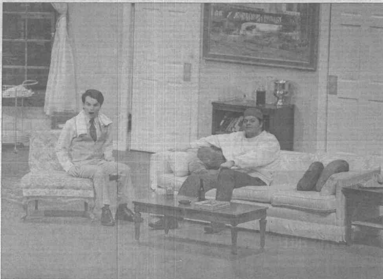
CHRIS FOX PHOTO Villa Park Review