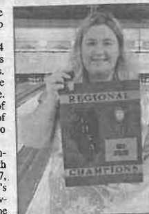
Rock Valley P