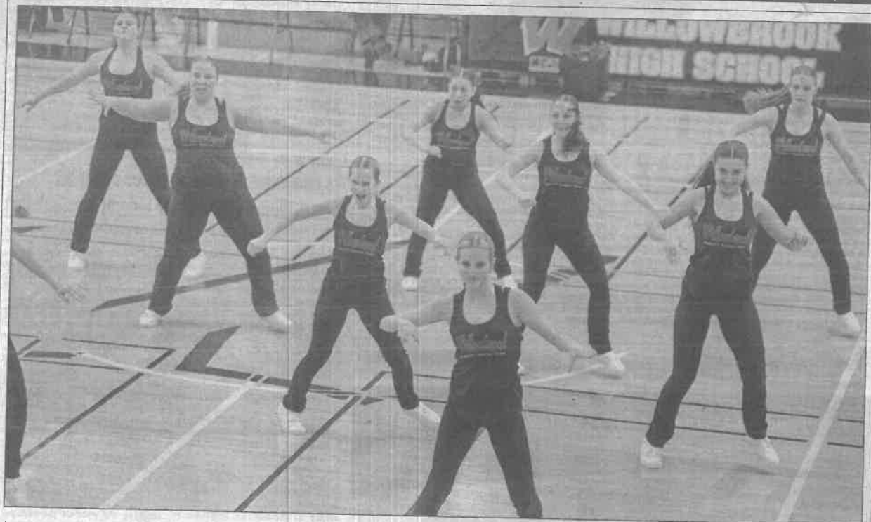
CHRIS FOX PHOTO Villa Park Review