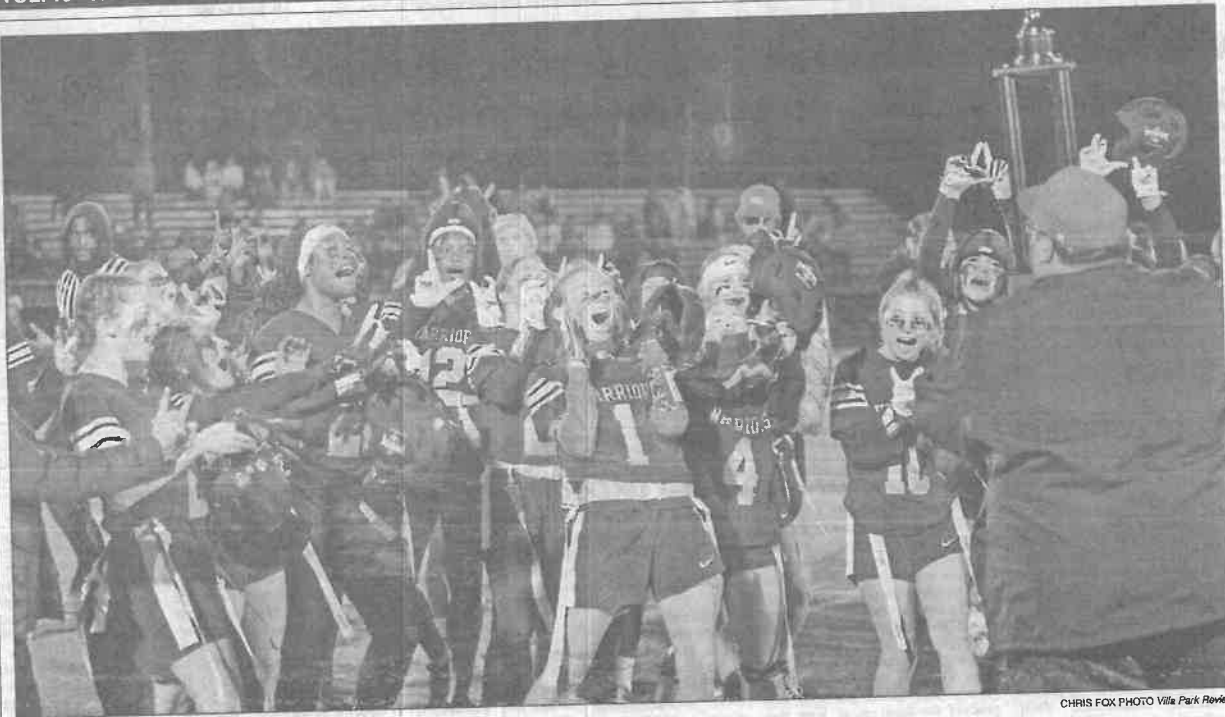
CHRIS FOX PHOTO Villa Park Review