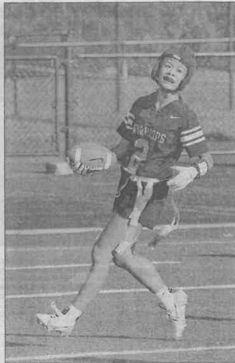
Rock Valley Public