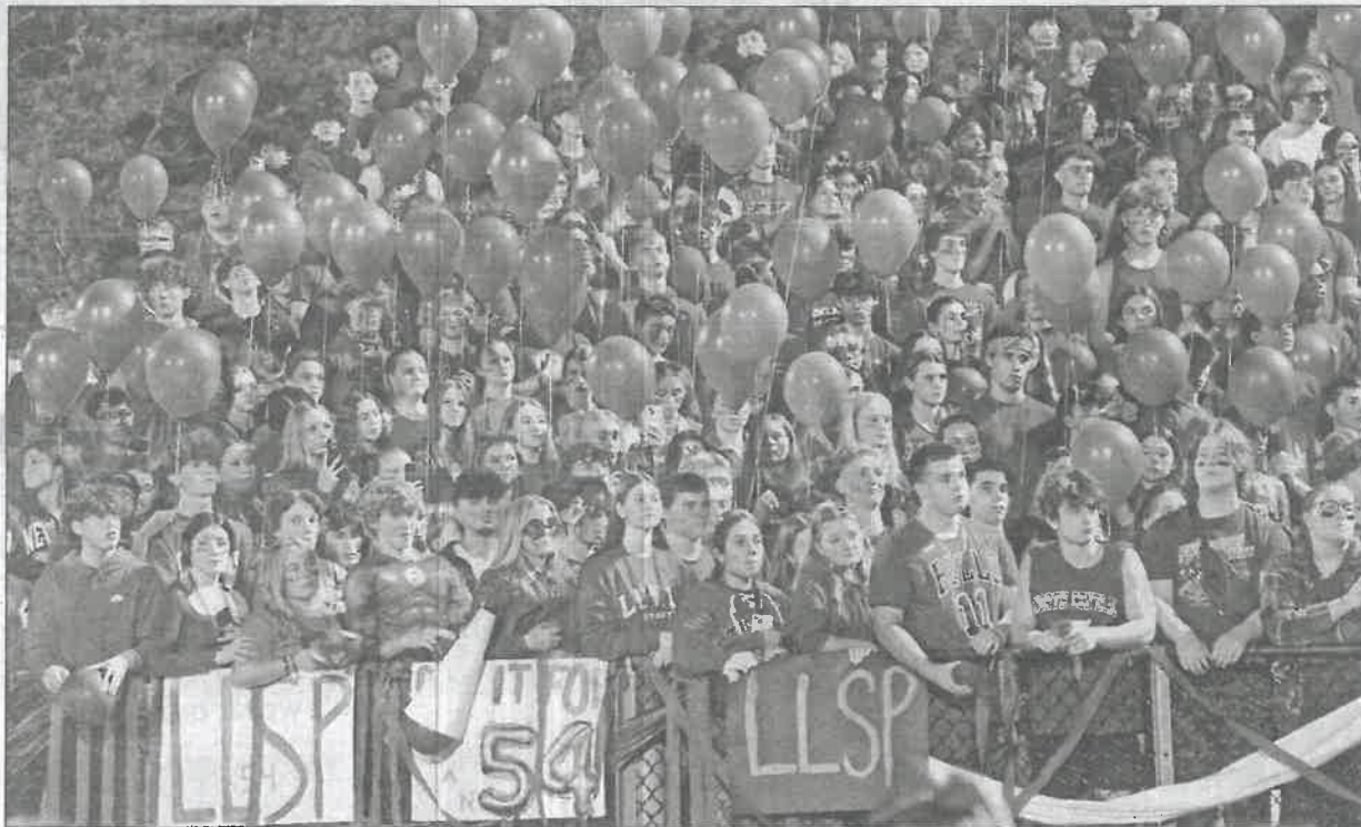
CHRIS FOX PHOTO Villa Park Review