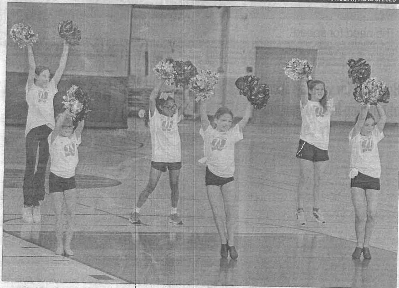
CHRIS FOX PHOTO Villa Park Review