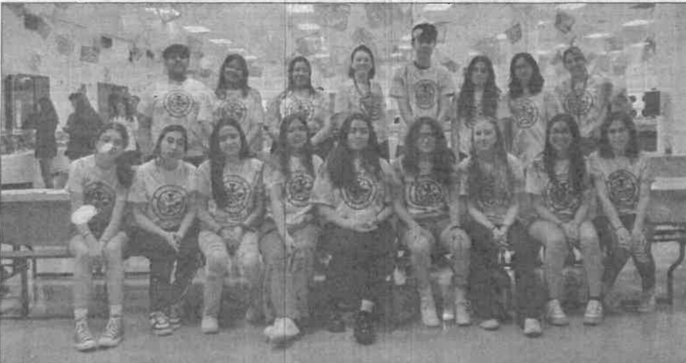
These members of Addison Trail's Interact Club helped put on the Kermes Latino Food Festival event that took place on Saturday, May 13.