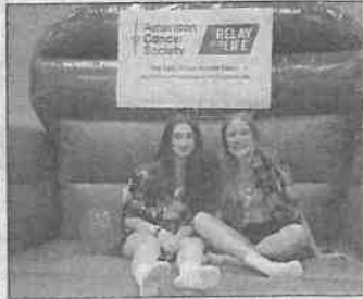
Rock Valley Pub