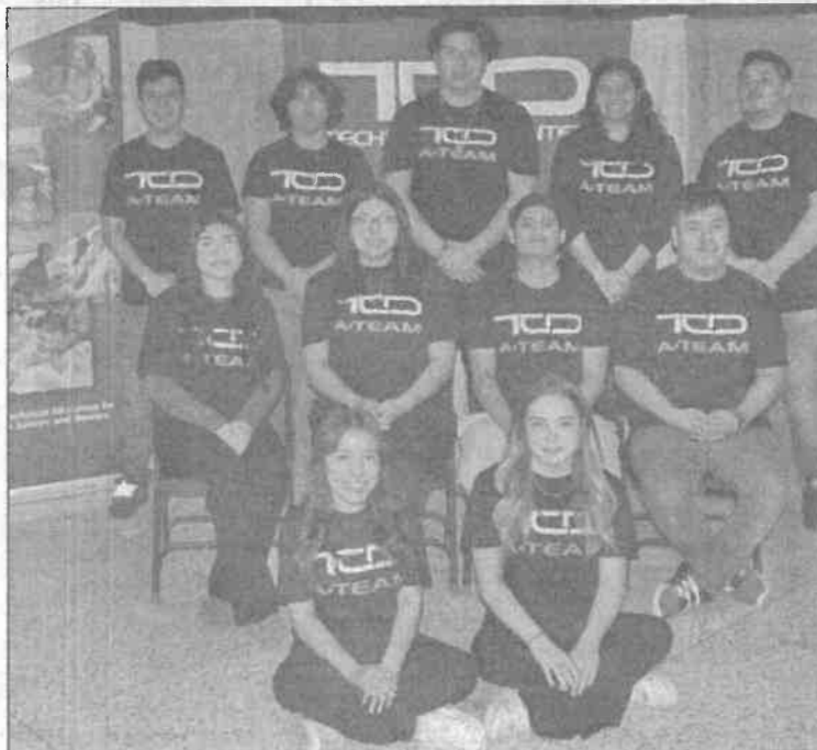
A ceremony took place on Friday, Feb. 17 at Technology Center DuPage to recognize the AT students who were named to TCD's A-Team. Honorees received a T-shirt and a certificate.