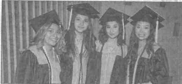
Villa Park Review