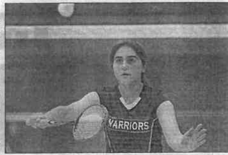
Villa Park