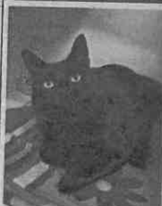
Sheldon has the cutest snaggletooth!

Sheldon is a handsome 6 year old black cat who is looking for his forever home! He is a silly guy who loves to get scratches on his head and play with toys. He would make a great addition to any family. Sheldon would do well with kids 5 years and older.