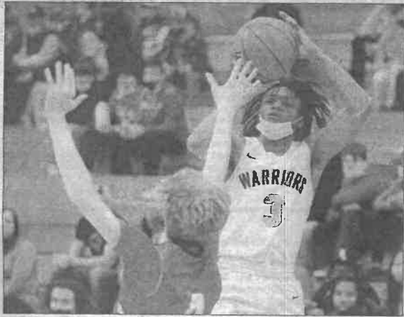
OFIIS FOX PHOTO Rock Valley Publishing