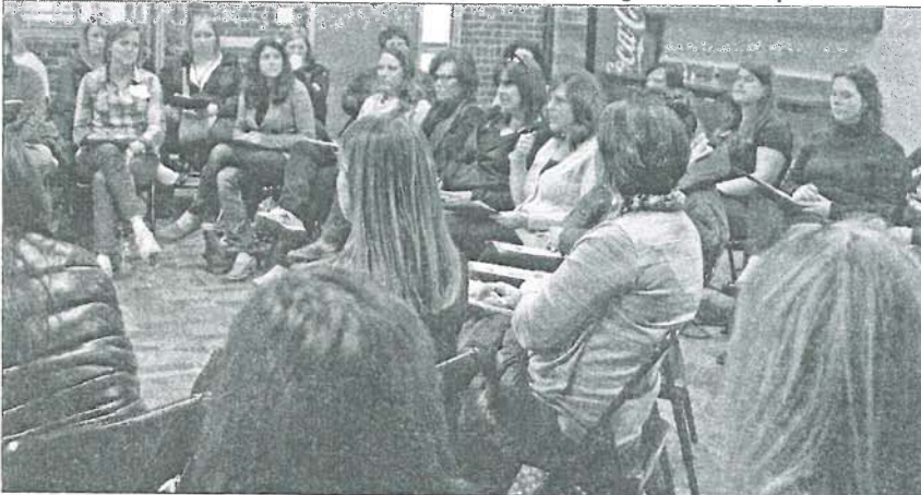
Above: Teachers and staff from Stone School hold a small group discussion at Institute Day on Friday, March 4. More than 1,200 people from District 4 and Addison Trail High School learned about "culturally responsive teaching and leadership."