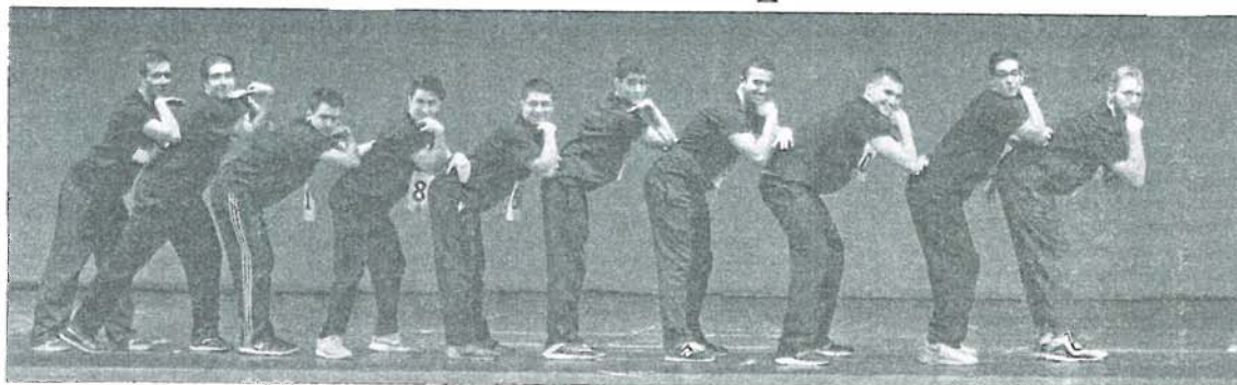
The Mr. AT 2016 contestants perform a group dance during the event, which took place on Feb. 20 at Addison Trail.