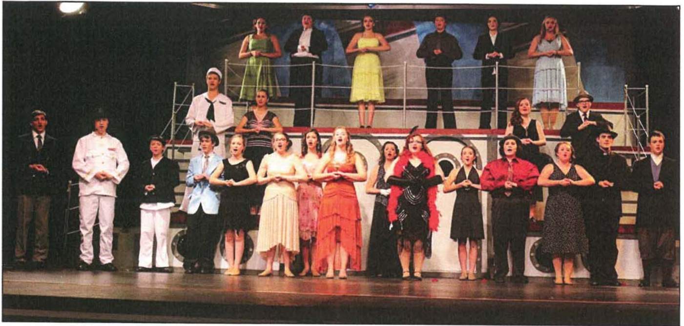
Athens High School students perform the song "Public Enemy" from "Anything Goes".

Education Conference. This year, music educators from across Illinois participated in 330 professional development sessions. This conference is one of the largest providers of music education professional development in the state. ILMEA also provides professional development year round for the Regional Offices of Education, school districts and ILMEA sponsored events.