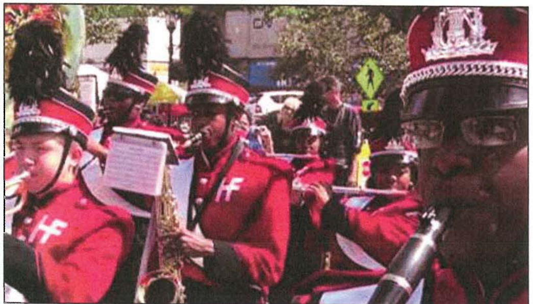
Members of the Homewood-Flossmoor Marching Band perform in a local parade.

March is "Music in Our Schools" month and many music teachers across Illinois are celebrating this event through concerts and programs that promote awareness of music education. This year, music teachers will be elated as they look to an educational landscape that acknowledges the benefits and importance of music. Please join us in this celebration of music education for all children in Illinois.