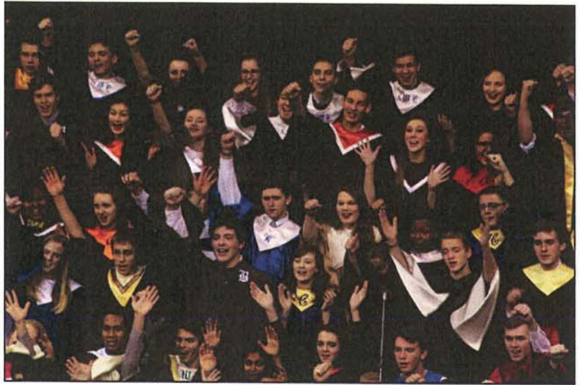
Members of the All State ILMEA Chorus perform "Cindy".

The ILMEA's core mission is to advocate for universal access to comprehensive music education,