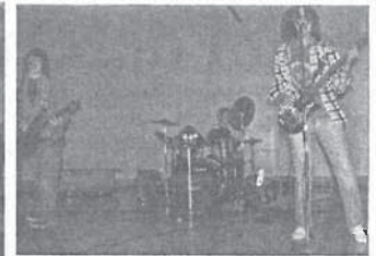
Pictured are the other four bands that took part in the WB Key Club's Battle of the Bands. (top left) Thunder Elephant; (middle left) Cokeanul; (bottom left) Warrior Rockband; and (above) Land Lines.