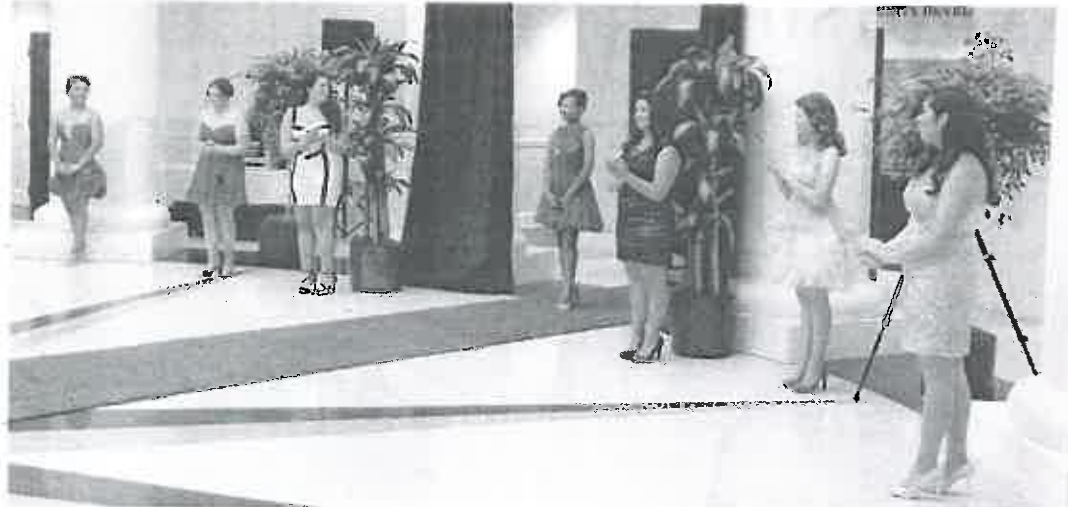
Seven contestants compete for the 2015 Miss Addison title June 24 in the Addison Village Hall atrium.