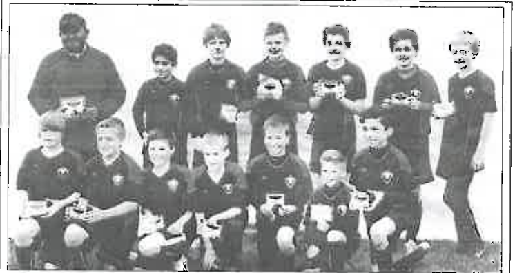
Firebirds' U-12 Spurs team takes second...