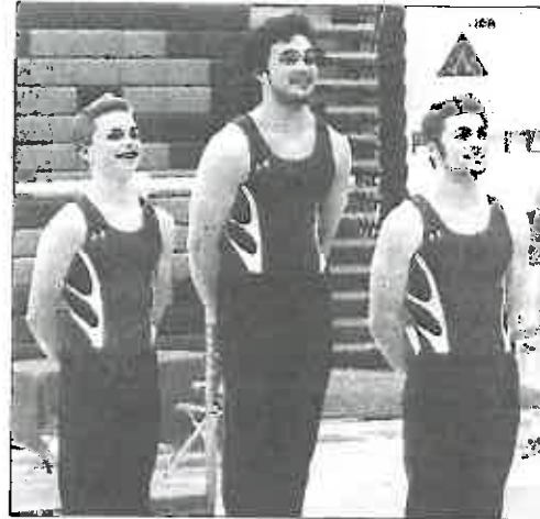
Quite a trio...

The Warriors set a new program record for a team score in any meet with their first-place performance at their previous event—the West Suburban Gold Conference Meet at Leyden on May 1. Willowbrook turned in a score of 149.2 at that meet to break a school record that had stood for 32 years. The 1983 Warriors held the school record with a meet score of 147.5.