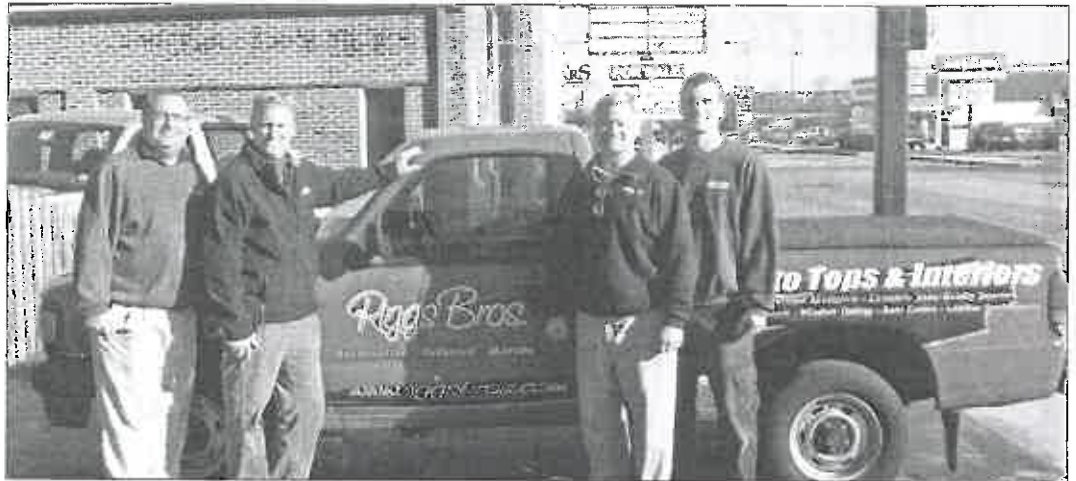
Pictured are the owner-operators of Riggs Brothers, located at 220 E. St. Charles Road in Villa Park, which is currently celebrating 70 years in the business of restoring auto, marine, and aviation interiors. Using high quality vinyl, leather, and upholstery grade fabrics installed by skilled craftsmen, four generations of Riggs have helped customers increase and enhance the value of their cars, boats, and airplanes.

There are many things Riggs Bros. can do, such as re-section the seat to replace the affected piece of leather or upholstery. Using the highest quality vinyl, leather, and upholstery grade fabrics, the craftsmen at Riggs Bros.