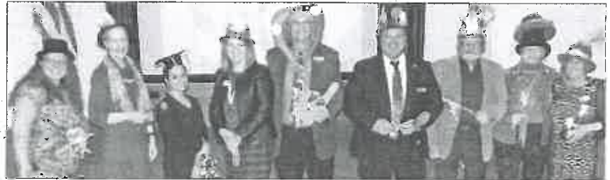
The Villa Park Chamber of Commerce 2015 Officers and Directors have some fun wearing their "superhero hats" during the installation and awards dinner.