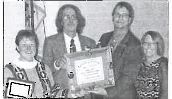
Pioneer Feed received a certificate of appreciation for its 50 years of membership in the Villa Park Chamber of Commerce. The award was given at the Chamber's installation and awards banquet, held at the VFW Post #2801 on Wednesday, Feb. 25