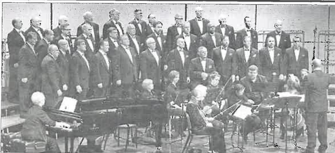
Submitted photo Spirito! Men of Spirito! perform at their winter concert, The Seven Joys of Christmas, earlier this month.