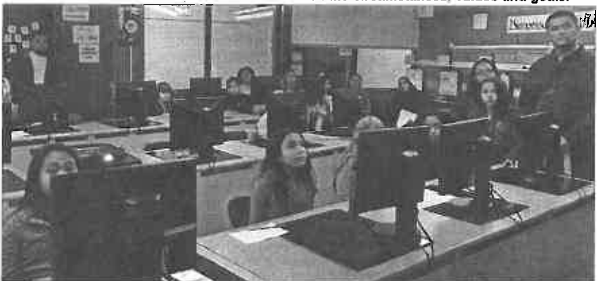
At the Mastery of Math event held at Indian Trail Junior High on Friday, November 5, teachers explained how to access the online textbook and the importance of this as a resource for students.