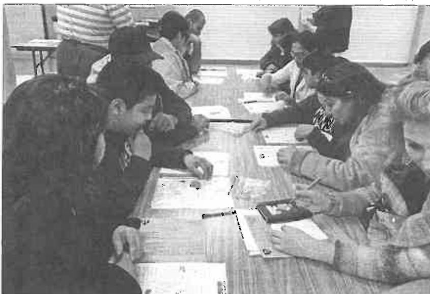
At the Bean Game, each individual student or family group received 20 beans and a set of spending category sheets. Each item had a set number of squares to indicate how many beans were needed to "pay" for that item. Each had to decide how to "spend" their beans, based on life circumstances, values and goals. A representative from MB Financial was at this station to briefly talk about budgeting and savings accounts.

School leaders are looking forward to planning additional events and opportunities for the College Bound Buddies to connect as the school year continues.