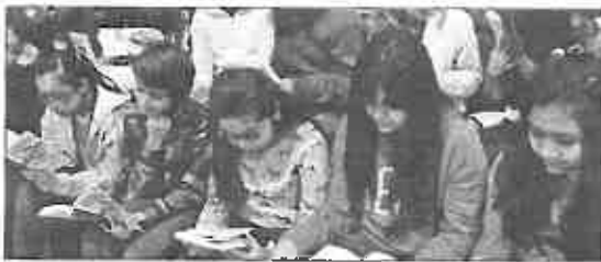
Jefferson Middle School students received copies of Charlie Joe Jackson's Guide to NOT Reading and begin reading immediately! The book was chosen for the school's annual One Journey, One School, One Book program.

All you need to begin learning in the comfort of your own home is a Villa Park Library Card number and PIN. For more information, visit our website at vppl.info or call 630-834-1164, Ext. 5.