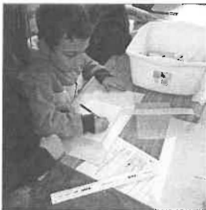
At the station called Measuring Masterpiece, students like this boy created an art design using least six strips of cardstock in varying lengths. A representative from Home Depot was on hand to demonstrate how to measure and why accurate measuring is so important in everyday life.