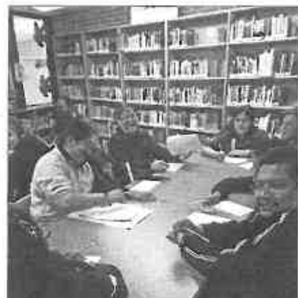
The Bean Game was a budgeting station — just for "bean counters!" Each individual student or family group received 20 beans and a set of spending category sheets. In this photo, a small group shares a laugh as they decide how to spend their "income" based on life circumstances, values and goals.