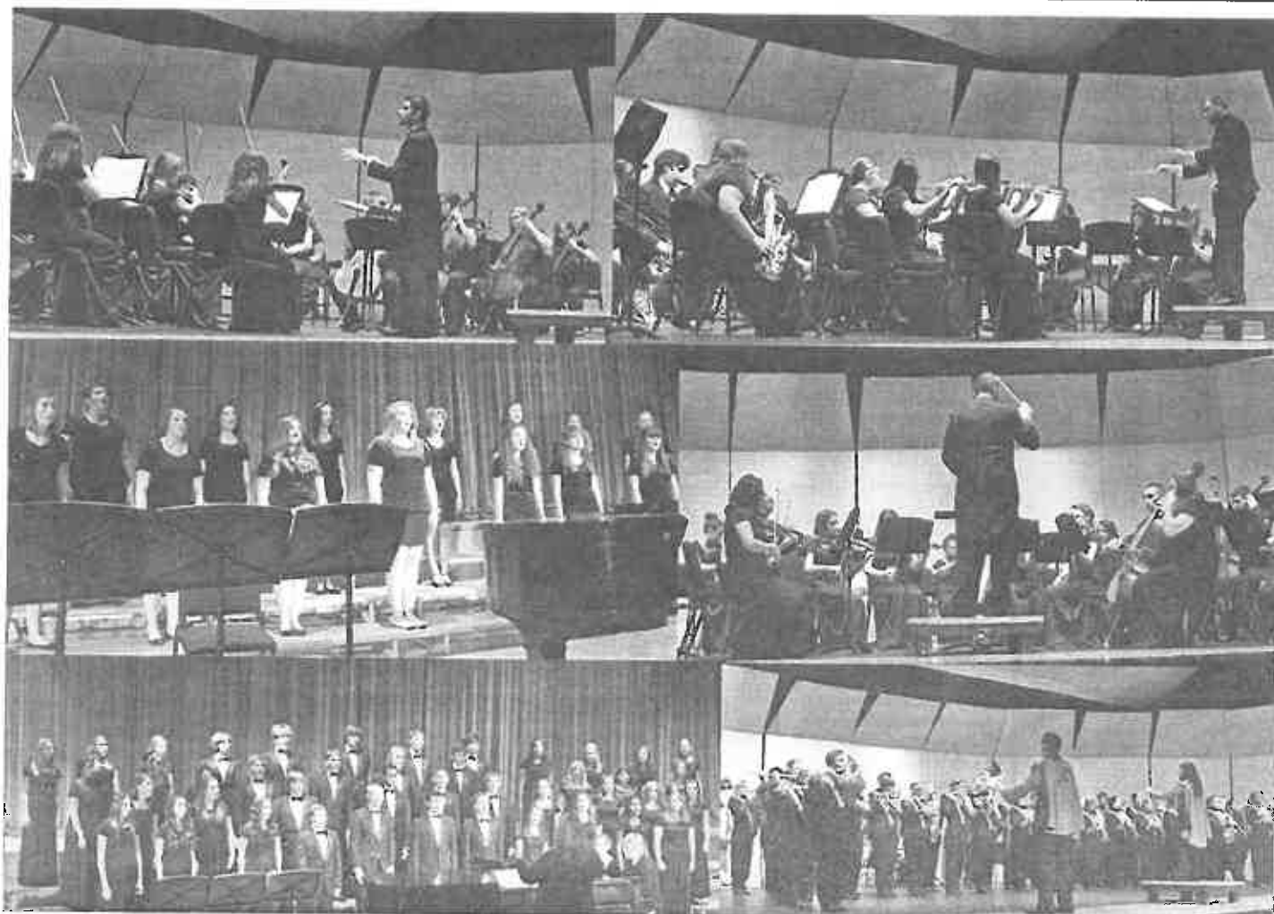
All photos provided