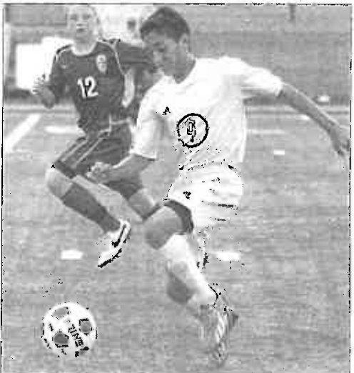
Impact player...