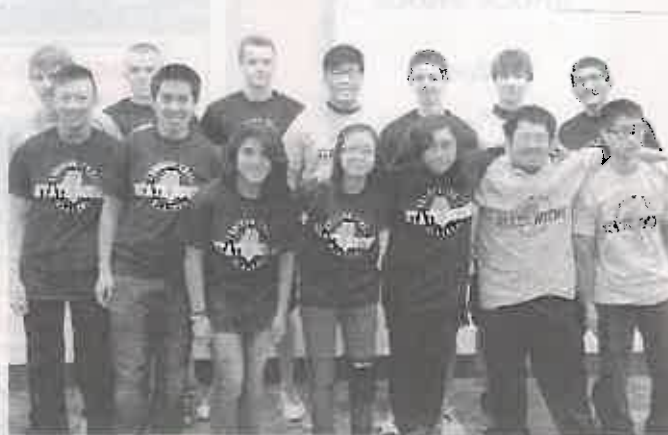
The Addison Trail High School Science Olympiad Team see a successful season, finishing second place March 15 at the Northern Illinois Regional Science Olympiad and competing at the state tournament April 12 at the University of Illinois at Urbana-Champaign.