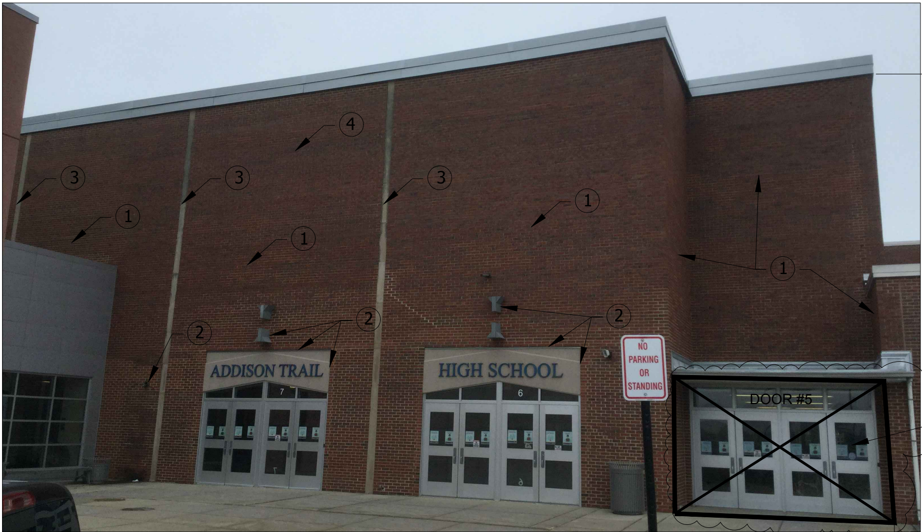
1 NORTH ELEVATION N.T.S.