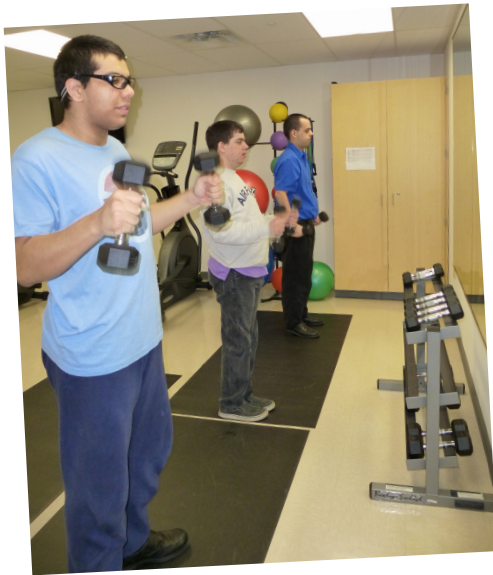
Adult Life Activities/Personal Care